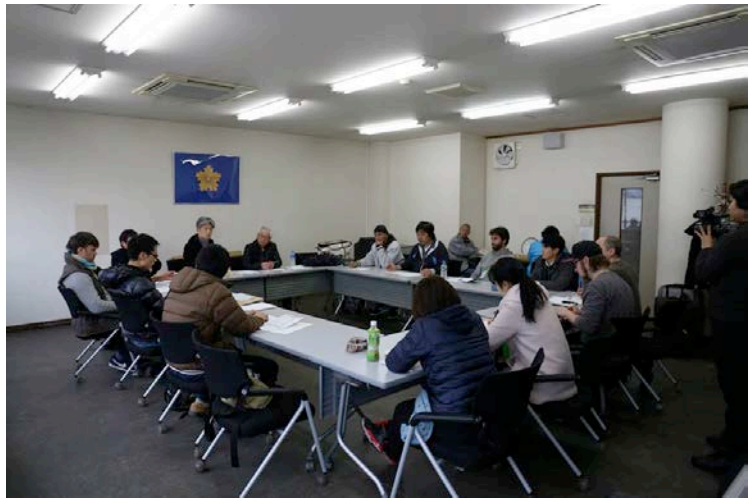
Camera Demonstration and Pre-Pro Meeting (Toei Studios Kyoto)

20:00～ ■Pre Production Meeting Venue: Accommodation 21:30 Discussion for the next day shooting