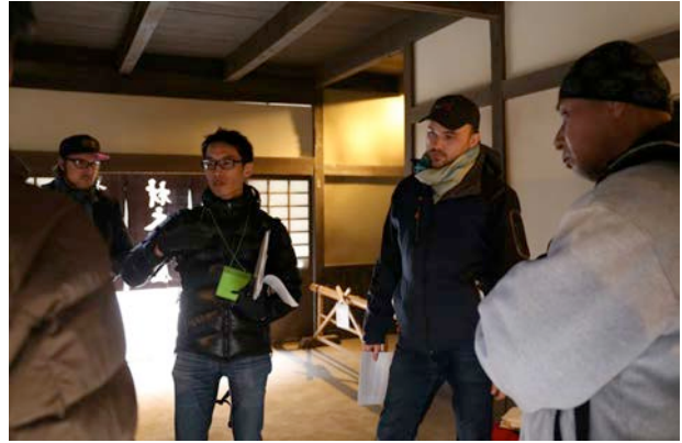
Shooting of Toei Team (Toei Studios Kyoto)