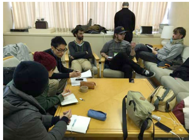
Post Production meeting (The Museum of Kyoto)