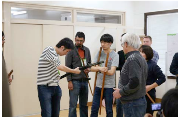
Sword Action Lecture (Toei Studios Kyoto)

16:00~ ■Pre Production Meeting Venue: : Toei Studios Kyoto, Shochiku Studios 18:00 Participants split into Toei team and Shochiku team and look at studios and set and had discussion for production. ■ Camera Demonstration by Blackmagic Design Venue: : Toei Studios Kyoto, Shochiku Studios