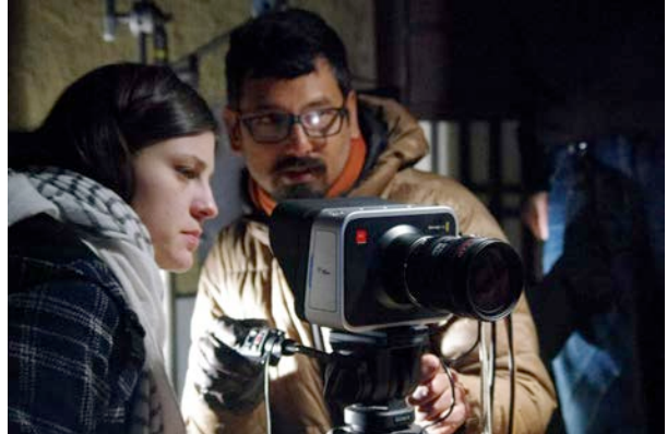
Shooting of Shochiku Team (Shochiku Kyoto Studio)

20:00～ ■Production Meeting Venue: Accommodation 21:30 Discussion for the next day shooting